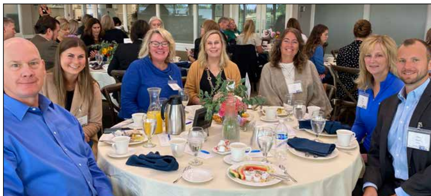
Community Leadership Breakfast.

Employees kicked off our United Way Campaign this past fall as a sponsor for the Community Leadership Breakfast, followed by LEB's Campaign Blitz Week. Employees participated in a Bags Tourney and hosted a silent auction – raising more than $6,800 for our local United Way.