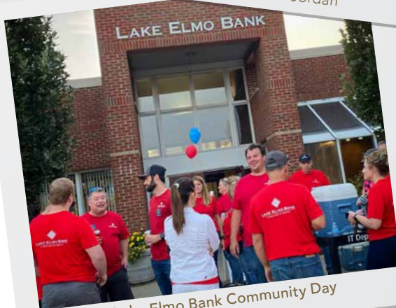
Lake Elmo Bank Community Day 2023