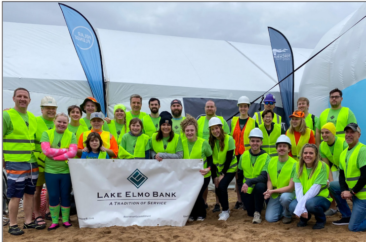
2024 Lake Elmo Bank "Lake Leapers".

Our amazing Lake Elmo Bank Polar Plunge team raised over $12,000 for the Minnesota Special Olympics this year, for a total of more than $45,000 over the past 6 years. This year, we had 18 LEB employees along with friends and family plunging for this worthy cause.