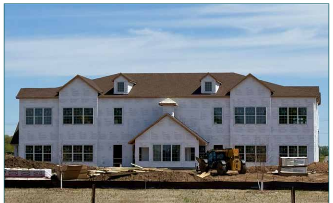
Primrose School of Lake Elmo - Opening October 2026

later, when they began exploring a new business opportunity, they knew Primrose was a concept they believed in and felt very passionate about bringing it to Lake Elmo, to give the growing community a premium childcare option.