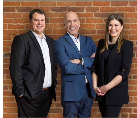
LEB Mortgage Team

Call our mortgage team today at 651.777.8365 to get started.